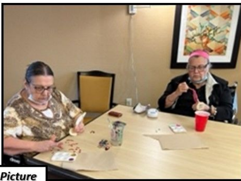
Spring Picture Frame Painting